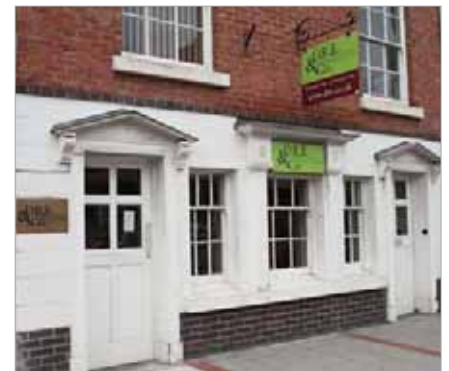
20 Broad Street, Newtown, Powys, SY16 2NA

Above all, flexibility is important. Circumstances change, as do tax rules. We can help you to formulate your wishes and make sure that your estate planning will achieve them in the most tax-efficient way.