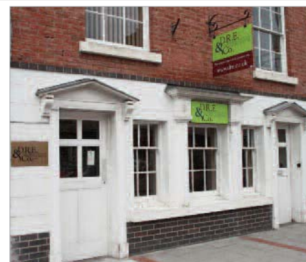
20 Broad Street, Newtown, Powys, SY16 2NA

You will also pay little or no vehicle excise duty on cars with CO 2 emissions up to 120g/km. Up to 100g/km, car tax is nil; and with 101-120g/km the tax is currently £35. On top of all these tax savings, running environmentally friendly cars will also boost your business's green credentials.